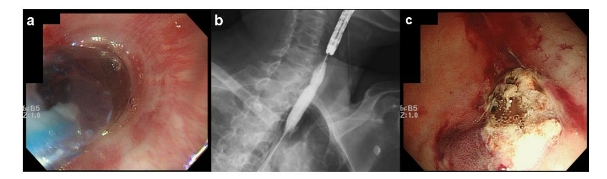
Figure 3. Endoscopic balloon dilation to facilitate thermal therapy at the bleeding point. ( a ) Endoscopic image during dilation; ( b ) radiograph during dilation; ( c ) endoscopic image after thermal therapy. The visible vessel has been cauterized, leading to complete hemostasis.

The scope was changed to the thinnest diameter (GIF-XP260NS, Olympus Medical, Tokyo, Japan; 5.4 mm), which could pass through the area of stenosis. A bleeding point was found at the antrum of the stomach with continuous bleeding caused by a Dieulafoy lesion and a large surface clot (Figure 2b). HSE solution was injected to the bleeding point using an injection needle through the thinnest scope to obtain the initial hemostasis and the injection achieved transient cease of the active bleeding (Figure 2c). Following this initial treatment, to achieve more effective hemostasis, the esophageal stenosis was dilated by balloon dilator to use the thermal therapy via normal diameter endoscope. The procedure went smoothly because the initial hemostasis was achieved by TNE, and the bleeding was completely stopped by cauterization (Figure 3a–c).