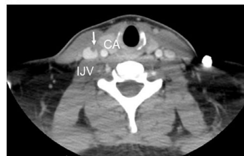
Fig. 2. Venous duplex ultrasound (A) of a 37-year-old woman revealed acute thrombus (arrows) in right internal jugular vein (IJV) with partial patency. The coronal view (B) and axial view (C) on computed tomography scans of the neck revealed a thrombus within the right IJV at the level of the thyroid extending cranially (arrows). CA, carotid artery.