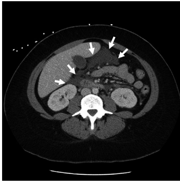
Fig. 1. Computed tomography scan of the abdomen of a 37-year-old woman with nausea, vomiting, and diarrhea. The scan, on hospital day 1, revealed a peripancreatic fluid collection (arrows) compatible with acute pancreatitis.

and pelvis was significant for pancreatitis with a small amount of ascites (Fig. 1). Based on these findings, patient was diagnosed with acute pancreatitis. At this point, the etiology of pancreatitis was unclear because the patient had not had alcohol for 1 week. She was transferred for admission to a general medical unit for the treatment of acute pancreatitis with unknown etiology.