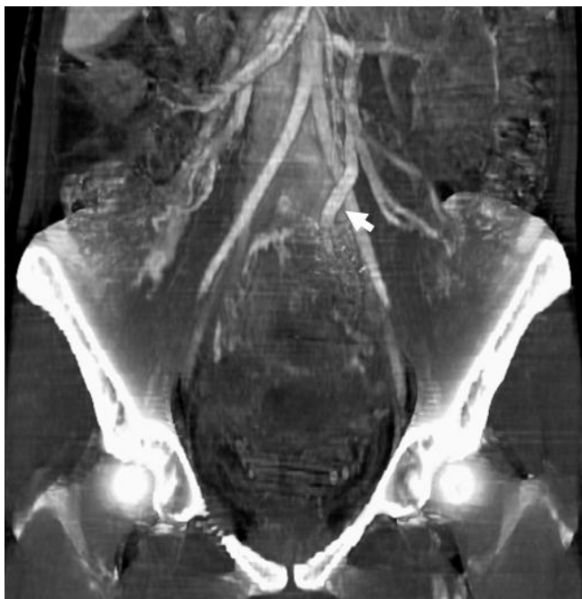
Figure 1 Contrast-enhanced CT-scan images with maximum intensity projections showing an increased diameter of the left ovarian vein. Three-dimensional reconstruction and anteroposterior view in which an increased diameter of the left ovarian vein (arrow) can be observed as an indirect sign of thrombosis.

A small rectus abdomini hematoma was revealed on abdominal and transvaginal ultrasound scans. A CT scan was requested to assess the late-postoperative abdominal pain. After intravenous contrast injection, a complete left POVT involving the junction of the ovarian vein with the renal vein was demonstrated. (Figures 1, 2, 3).