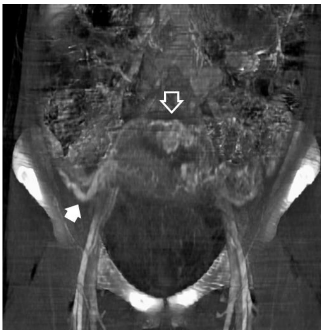
Figure 3 Contrast-enhanced CT-scan images with maximum intensity projections showing a large number of uterine variceal vessels. Three-dimensional reconstruction and anteroposterior view in which a large number of uterine variceal vessels can be seen (open arrow) as well as collateral venous drainage pathways (solid arrow).

kocytosis and a homolateral palpable mass [4,7]. Some of these symptoms were present in our case.