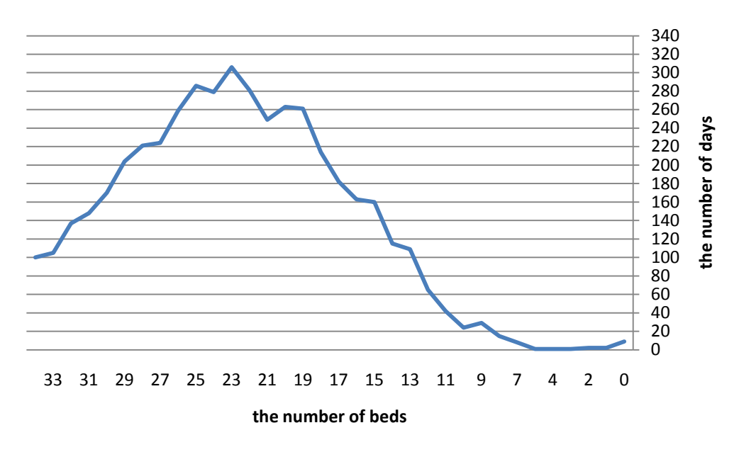
Fig. 1: The number of beds for 5000 simulated admission days

(4535 d). Of course, the probability of need for over the 33 beds is very few that are cardiac surgery department will be required to over the 33 beds only in 9.3% of days (efficient cut off point).