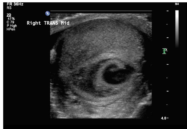
Figure 1. Scrotal ultrasound of the right testicle in transverse revealing a hypoechoic lesion within the central testicle with an anechoic central core.

radical orchiectomy. Tumor markers were obtained prior to orchiectomy and were within normal limits. He tolerated the procedure without any adverse event and was discharged to home with resolution of his pain on the first post-operative morning. Pathologic evaluation confirmed the presence of significant intraparenchymal hemorrhage within a background of chronic orchitis (see Figure 3 ). At the time of post-operative follow-up – 2 weeks after his orchiectomy – the patient was in excellent condition with complete resolution of his pain. His surgical incision was well healed and he had no evidence of intra-scrotal pathology.