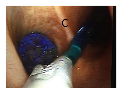
Fig. 2. E-Z Blocker @ Bronchial Blocker with left mainstem bronchus balloon inflated. C = carina.

Upon insertion of a 10 mm endo-eye camera (Olympus America Inc., Center Valley, PA), the rib fractures were readily identified. Approximately 150 cc of retained hemothorax was removed via suction. The rib fractures were then sequentially exposed by incising the overlying parietal pleura using a hand-held Bovie electrocautery device with a tip extender. Next, the fracture fragments were reduced by making a stab incision in the overlying skin with a no. 11 blade, and passing a no. 2 braided suture around each rib fragment using a Carter Thomason CloseSure suture passer (CareFusion, Inc., UK) under thoracoscopic visualisation. Two stab incisions were required to pass a total of eight sutures (two sutures around each of four rib fractures). The first assistant then pulled up on the sutures to reduce the fracture, and held tension on the suture to maintain reduction. Universal plates (MatrixRib, Depuy Synthes CMF, Inc., Westchester, PA) were then manually bent to match the concavity of the chest wall and introduced into the pleural space on a Kelley clamp though the