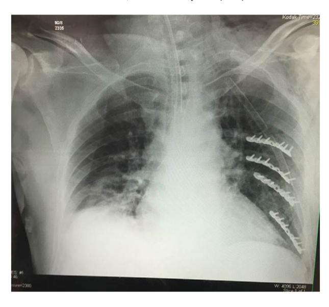
Fig. 4. Immediately post-operative CXR showing intra-pleural plates with reversed screw direction.

does not overcome the aforementioned limitations of fixation to the outer cortex of the rib. By contrast, a totally thoracoscopic SSRF, including fixation to the inner cortex, affords the opportunity to achieve effective reduction and stabilisation without the disadvantages of the current open approaches.