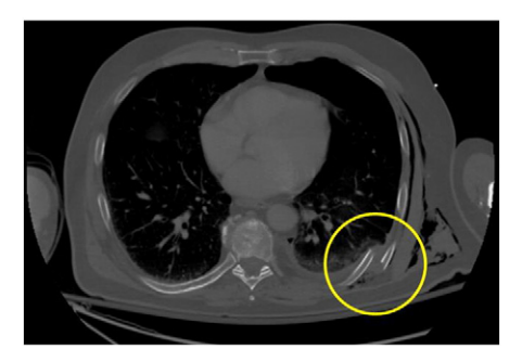
Fig. 1. Pre-operative CT chest showing severely displaced left posterolateral 8th rib fracture.

a left hydro-pneumothorax and severely displaced lateral fractures of left ribs 6–9 (Fig. 1). Initial management involved regional analgesia with a percutaneous para-vertebral catheter (OnQ Silver Soaker®, 19 cm, 4.5F, Kimberly–Clark, Roswell, GA) and pulmonary toilet. The patient was offered SSRF based upon the fracture pattern of ≥3 contiguous fractures with bicortical displacement [4]. The patient agreed to proceed, and written informed consent was obtained.