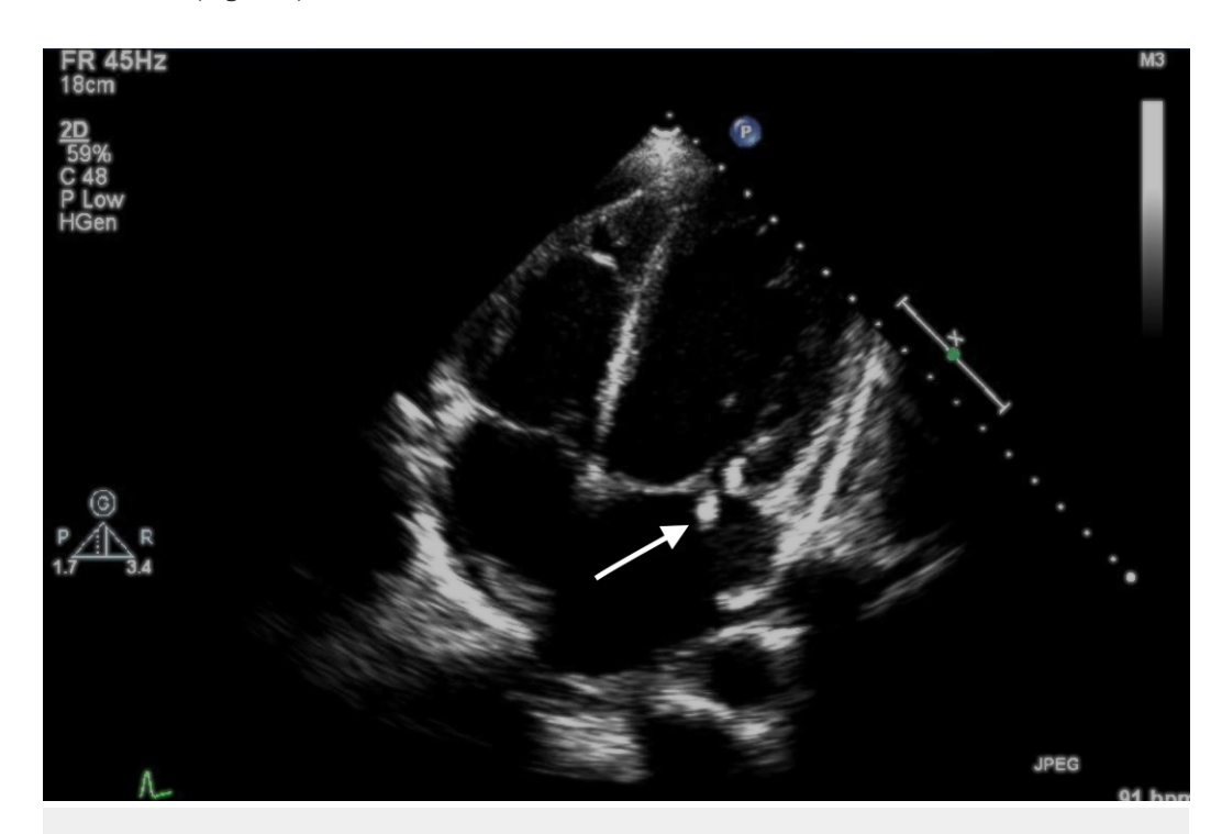
FIGURE 1: Transthoracic echocardiogram (TTE) showing mobile echodensity (arrow) on the mitral valve leaflet measuring 1.5 x 1.3 cm

denied this at first. Neurology and cardiology teams were asked to evaluate the patient emergently. A transthoracic echocardiogram (TTE) revealed a 1.5 \times 1.3 \, \text{cm} vegetation on his mitral valve (Figure 1).