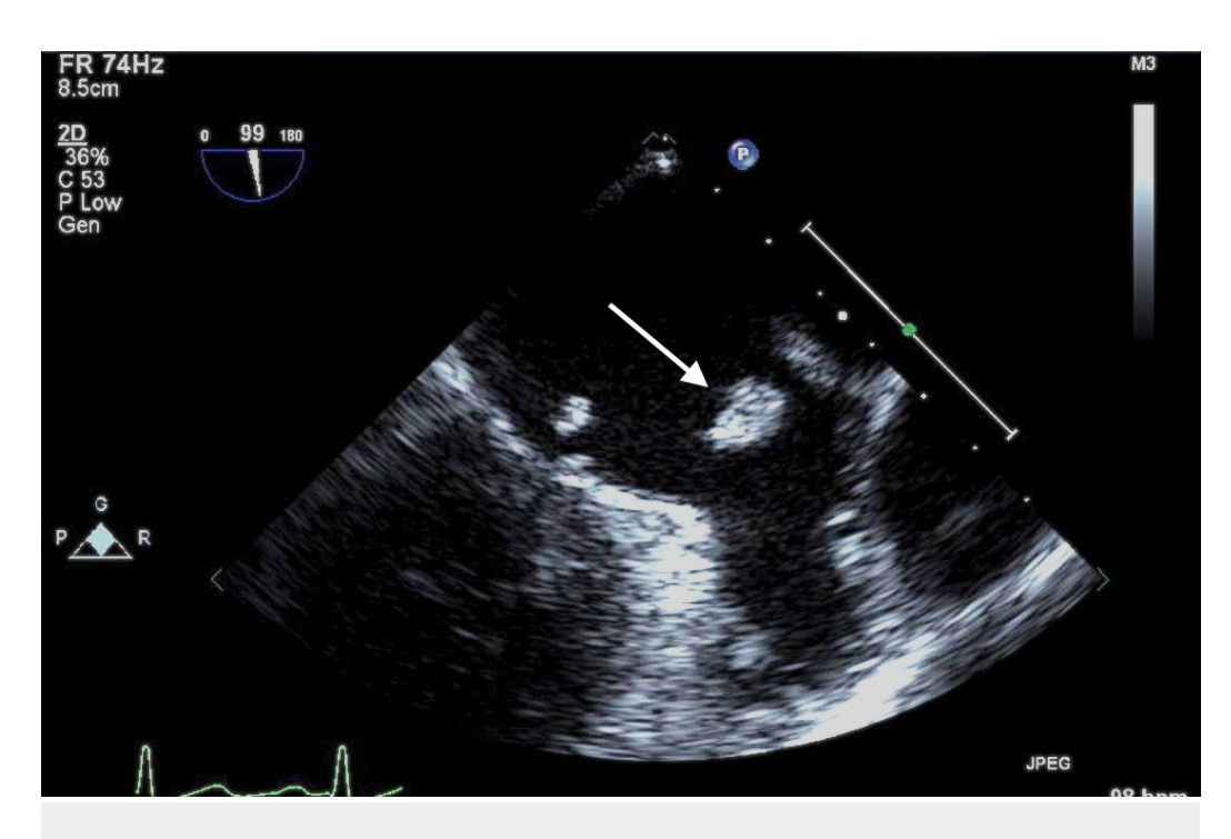
FIGURE 3: Transesophageal echocardiogram (TEE) showing the mitral valve vegetation (arrow)

He underwent emergent mitral valve replacement surgery to prevent recurrent embolic strokes.