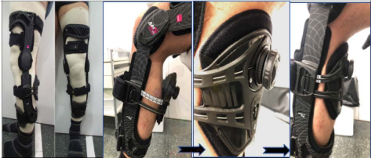
Fig. 3 Specific posterior cruciate ligament knee brace from Medi, the M4.s posterior cruciate ligament Dynamic Brace showing the mechanism to counteract posterior tibial sag (Courtesy of Medi Bayreuth Spain SL).