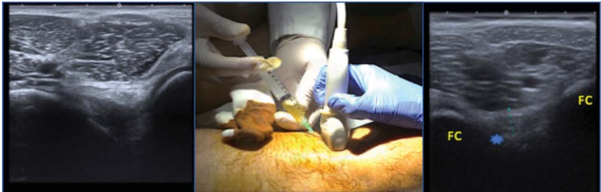
Fig. 4 Ultrasound-guided injection of PRGF Endoret (BTI) inside the posterior cruciate ligament sheath. *Determines axial view of posterior cruciate ligament body. FC, femoral condyle.

sag of the tibia, and therefore helps the healing of the PCL in the right tension. 6,13 The brace hinge should be placed at the level of the femoral condyles, and the straps tightened sequentially following the manufacturer's order. Then, the posterior padded support is tightened to correct the posterior tibial sag. Care should be especially taken to avoid excessive tensioning of the posterior padded support so as to avoid skin injuries. Plain lateral radiographs at 90 degrees of knee flexion are obtained before and after the application of the specific PCL brace to assure that the tension of the brace is adequate to reduce posterior tibial sag. The brace is worn at all times during the first 3 months, and discontinued at rest only during the following month. The patient is evaluated weekly during the first month to assure adequate tolerance and positioning of the brace.