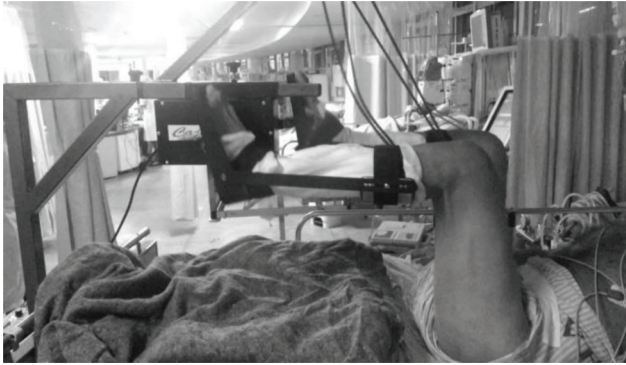
Figure 1 - Illustration of passive cycle ergometer application on lower limbs in critical patients under mechanical ventilation.

plate are added, resulting in the complex Bc-Ag-Ac-enzyme (sandwich technique). A second wash is performed for the removal of unlinked antibodies. Then, a substrate is added that has the property of assuming a different coloration when in contact with the enzyme; this colour is proportional to the amount of mediator present in the sample (antigen). The reading is obtained in a plate reader (Bio-Rad, Tokyo, Japan) at 450 nm and compared to a standard curve obtained with known concentrations of recombinant mediators.