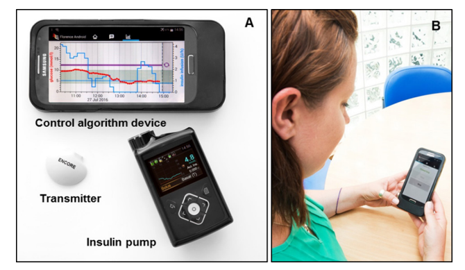
Figure 2 Closed-loop system prototype. (A) Components of the FlorenceM closed-loop system consist of a continuous glucose monitoring (CGM) transmitter with Enlite 3 sensor, an insulin pump (modified 640G pump) integrated with the CGM receiver and a mobile phone running the control algorithm. (B) A photo of a participant (obtained with consent) using the closed-loop system.

the study insulin pump. Calculations use a compartment model of glucose kinetics describing the effect of rapidacting insulin analogues and the carbohydrate content of meals on glucose levels.<sup>20</sup> The control algorithm will be initialised using preprogrammed basal insulin delivery downloaded from the study pump. In addition, information about participants' weight and total daily insulin dose will be entered at setup. During closed-loop operation, the algorithm adapts itself to a particular participant. The treat-to-target control algorithm aims to achieve a default