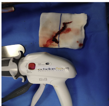
Fig. 2. Resected esophagus (note the size and the length).