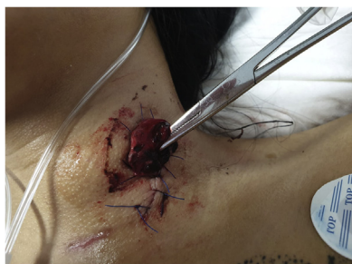
Fig. 3. Cervical esophagostomy.