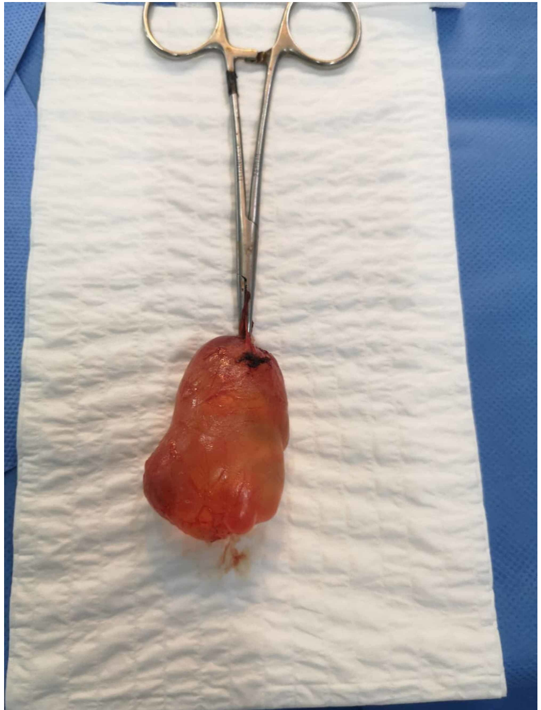
FIGURE 3: Image showing the resected cyst

Histological examination of the specimen showed a 5.5 cm cyst bordered by a heavily abraded squamous epithelium, with the presence of atrophic parathyroid parenchyma. This concluded the diagnosis of a PC.