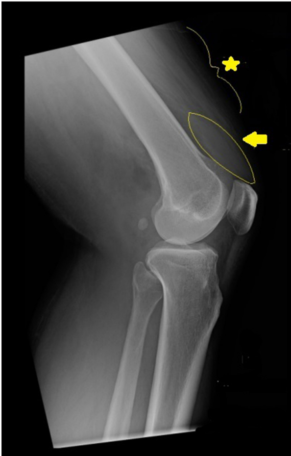
Figure 1. Right knee radiograph with joint effusion (star) and soft tissue swelling (arrow).

and his leukocytosis resolved post-operatively, he continued to have pain and swelling with an associated rise in CRP to 25.4 mg/dL on hospital day 4. Orthopedic Surgery thus planned for repeat irrigation and debridement, but on hospital day 5, the patient left the hospital against medical advice and unfortunately was lost to follow-up thereafter.