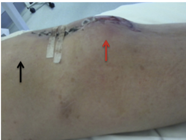
Figure 1. Left leg swelling (red arrow) below the knee (black arrow) viewed from the medial side.

ATA = anterior tibial artery; PTA = posterior tibial artery; TPT = tibioperoneal trunk.