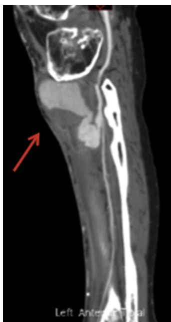
Figure 2. Sagittal computed tomography angiogram of the left leg demonstrating a pseudoaneurysm from the proximal anterior tibial artery (red arrow).

This case highlights the advantages of an endovascular strategy when managing tibial artery pseudoaneurysms in patients with multiple previous surgeries.