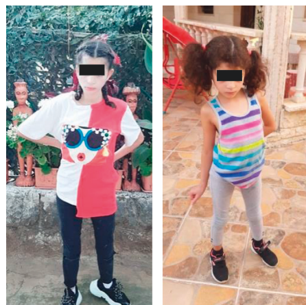
FIGURE 1: (a) Pedigree of the affected family. (b) Sanger sequencing electropherograms showing the TMTC3 variant c.211C>T (red box) at a heterozygous state in parents and at a homozygous state in the affected daughters. (c) Photographs of the patients.