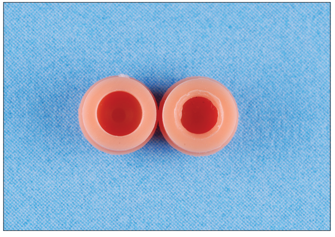
Figure 4: Two prefabricated same pink color plastic caps exhibit different shape before usage.

overdentures.<sup>[2,14,17]</sup> The retention values of three metal clips were significantly higher than 1 metal clip in both vertical and posteroanterior directions (P < 0.05). It means that increasing the number of metal clips affected the retention values of these attachments. This finding does not apply to the number of plastic clips, because the retention values of 3 and 1 plastic clips were not significantly different in all directions of dislodgment. These findings agreed with previous studies<sup>[2,15]</sup> and may be related to the position of the retentive clips on the bar.<sup>[23]</sup> However, Breeding et al. <sup>[25]</sup> reported significantly more retention with increasing of plastic clips.