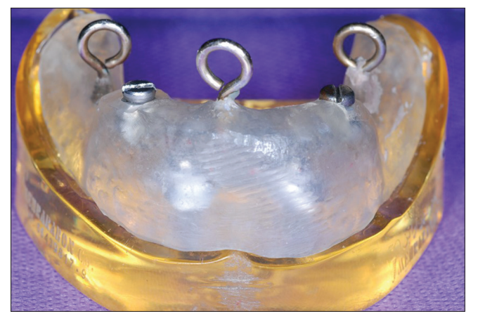
Figure 3: The overdenture with 3 hooks.

vertical, posteroanterior (by disconnection of anterior chain), and lateral (by disconnection of right chain) directions to simulate function. After 12 pulls, the plastic clips and caps were renewed and the metal clips and Elliptical matrix were reactivated.