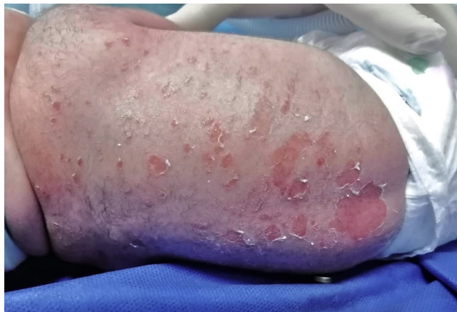
FIGURE 1 One-day neonate with diffuse erythema macular papular rash desquamation

Every CCC approach should begin with clinical suspicion. However, a definite diagnosis, including microscopic evaluation, and the culture of Sabouraud dextrose agar from the mucocutaneous lesions, placenta, or umbilical cord, should be assessed. 5–8 The clinical course is benign and auto-limited. Generally, skin lesions resolve within 5–20 days. However, this condition might lead to systemic involvement, the former embrace Candida septicemia, meningitis, bronchopneumonia, arthritis,