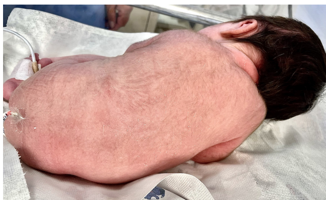
FIGURE 3 Fourteen days of life. Back skin involvement resolution

and endocarditis, associated with high mortality rates. 5 Therefore, it is essential to evaluate complications. 8 However, extensive evaluation should be warranted when respiratory distress, positive cultures from blood, urine, and cerebrospinal fluid, leukocytosis with left shift, and burning-like dermatitis. 9,10