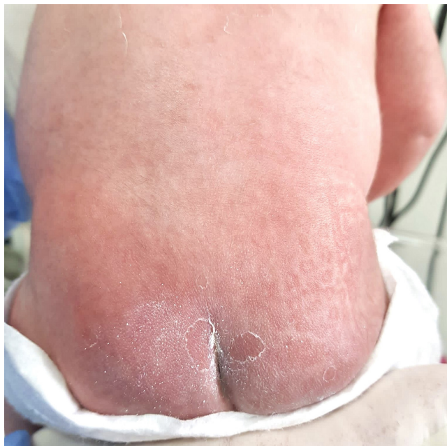
FIGURE 2 Ten days of life. Skin involvement resolution