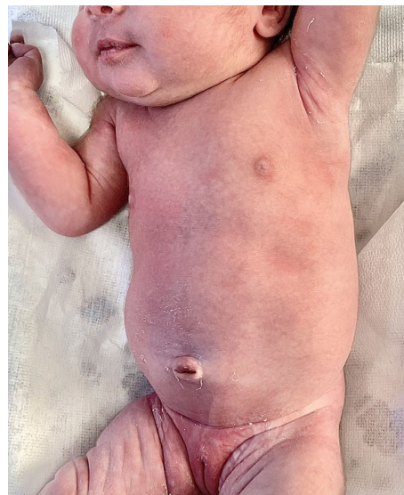
FIGURE 4 Fourteen days of life. Skin involvement resolution

Regarding the treatment for CCC, topical Nystatin is the most common treatment, followed by topical Clotrimazole. 1 On the contrary, systemic antifungal therapy has efficacy in neonatal sepsis, weight <1500 g, broad-spectrum antibiotics previous treatment, respiratory distress, positive cultures, and immunodeficiency. 5-9 Management includes non-azole antifungal Amphotericin B, 1mg/kg for Amphotericin B deoxycholate, 5 mg/kg for lipid-associated Amphotericin B preparations, and 6–12 mg/kg fluconazole. 3-10 In addition, Caspofungin