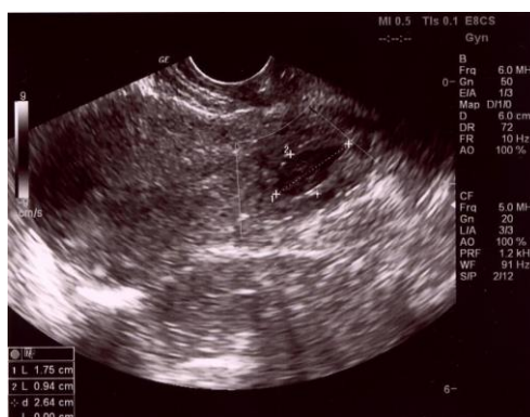
Figure 1. Ultrasonic picture of cervical pregnancy .

Monopolar rollerball was used to make hemostasis and Fibrillar net was placed in cervical canal to secure hemostasis. Patient was discharged three days later with \beta HCG level of 1.7 IU/L with no further abnormal bleeding or other symptoms.