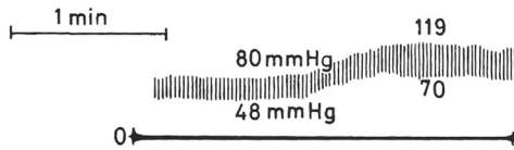
Fig. 1 Intra arterial pressure monitoring showing one out of the four short-lasting increases of blood pressure, which occurred after the first intrathecal injection of neostigmine. Rossier et al. [9]. Reproduced with permission from Nature Publishing

Recording made 62 minutes after the intrathecal injection of 0,25 mg of prostigmine.