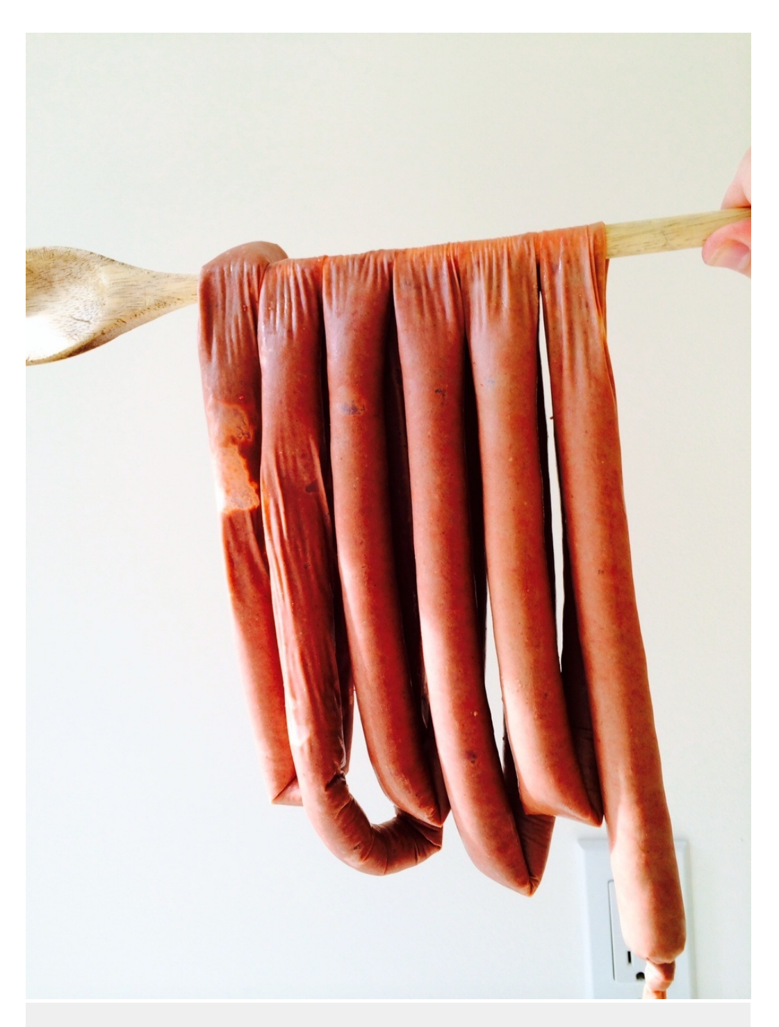
FIGURE 5: Loops of Simulated Intestine

Loops of simulated intestine (25-cm long) were draped over a wooden spoon and then were tied together to make a shape similar to a "bouquet".