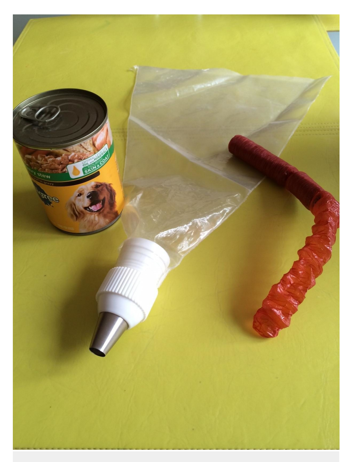
FIGURE 3: Materials for Making an Intestine

We used a pastry piping device, sausage casing, and a can of dog food to create the simulated bowel.