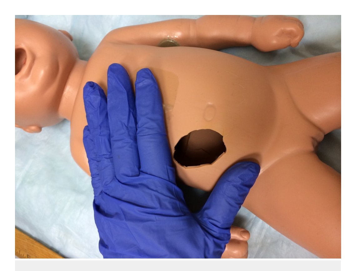
FIGURE 2: Manikin With Hole

A 4-cm hole was made in the abdomen of the manikin.