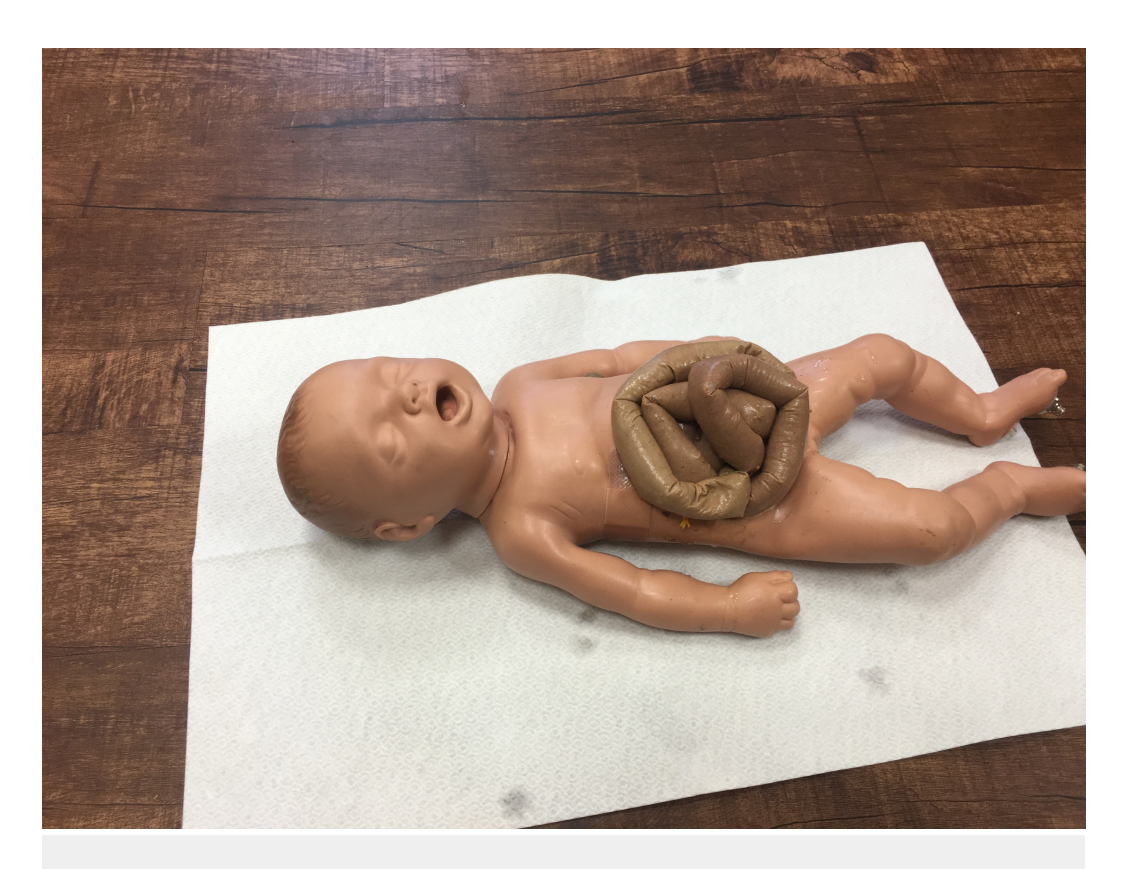
FIGURE 7: Manikin With Simulated Intestine in Place

Simulated intestines in place and secured with the string protruding through the back and held in place with a tape.