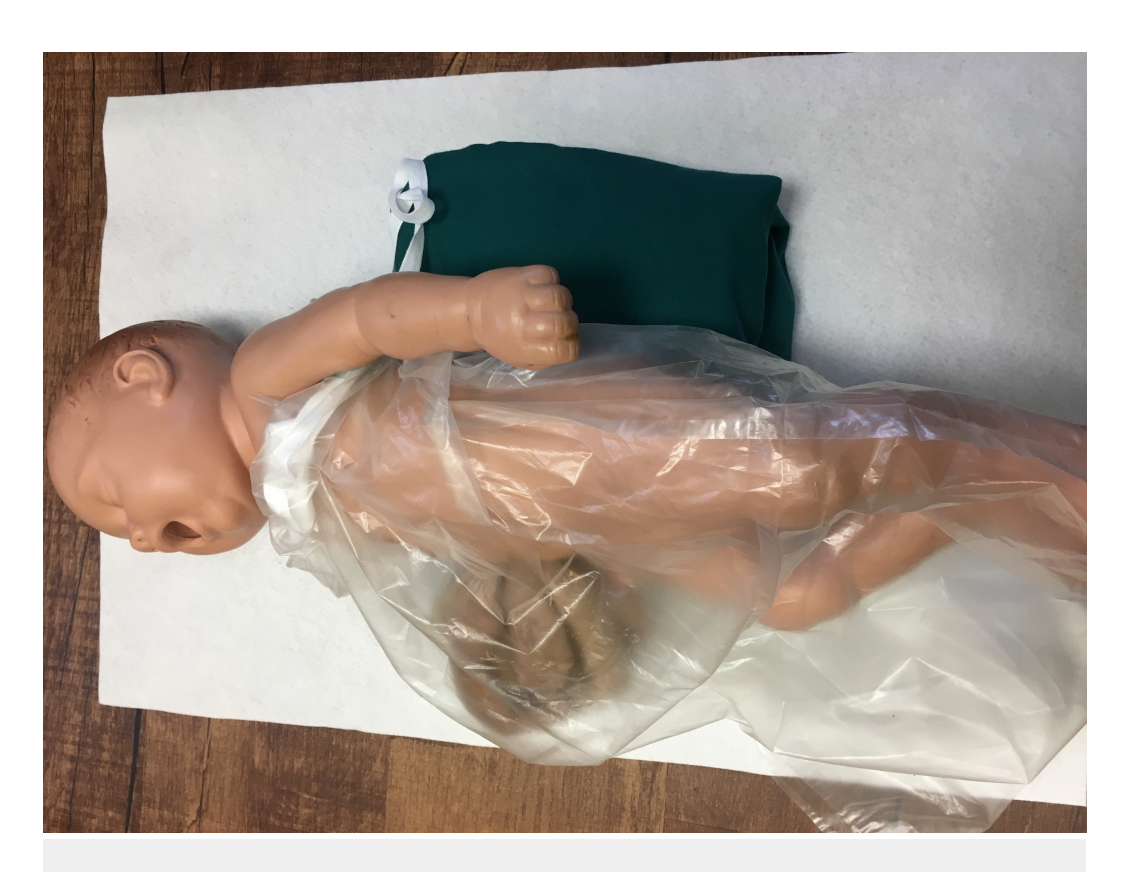
FIGURE 1: Simulation Model With Occlusive Bag in Place

Babies with gastroschisis are placed in an occlusive bag up to their axilla and the cotton tape is cinched, protecting the baby from evaporative and thermal losses.