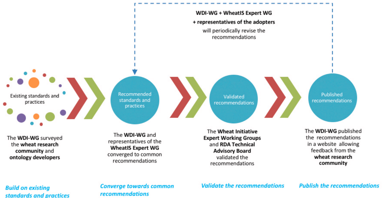
Figure 1. A community driven methodology for data interoperability guidelines design.

community. The second survey, “Towards a Comprehensive Overview of Ontologies and Vocabularies for Research on Wheat”, focusing on ontologies and vocabularies, allowed the WDI-WG to collect information about the visibility, interoperability, domain, and content of relevant ontologies and vocabularies. The questions and answers of this survey are also presented in a report 4 and summarized in SuppMat2 .