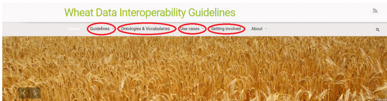
Figure 2. Main items in the menu of the wheat data interoperability guidelines.