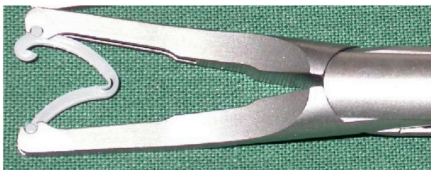
Fig. 1. Hem-o-lok stapling.

A total of 147 patients underwent our TEP method performed by only one surgeon. All patients were men aged 19–82 years. Hernia type