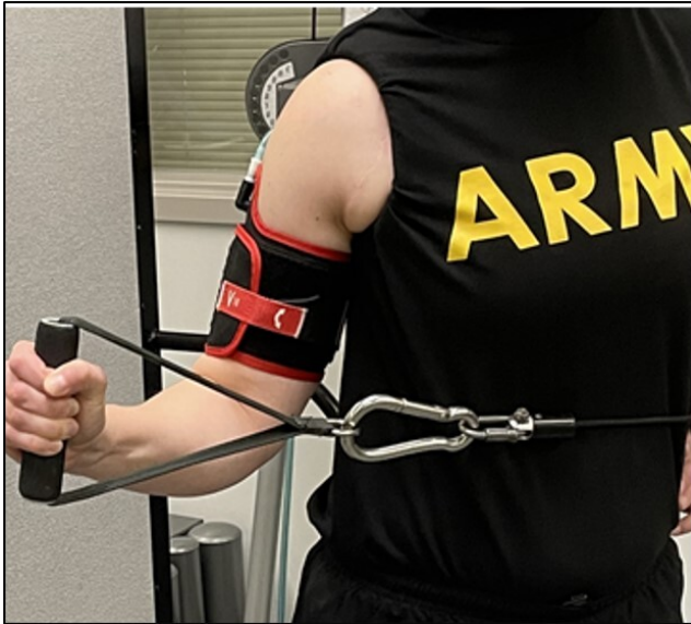
Figure 2. The Blood Flow Restriction tourniquet was applied to the upper brachium of the surgical extremity

the starting resistance for their surgical extremity. On their non-surgical extremity, participants performed the same procedure but selected a resistance at an RPE between 15 (hard) to 17 (very hard), corresponding to between 70% to 90% of a one-repetition maximum effort. 26 Participants were permitted to adjust the resistance as needed but were instructed to keep pre-BFR resistance within the predetermined RPE ranges.