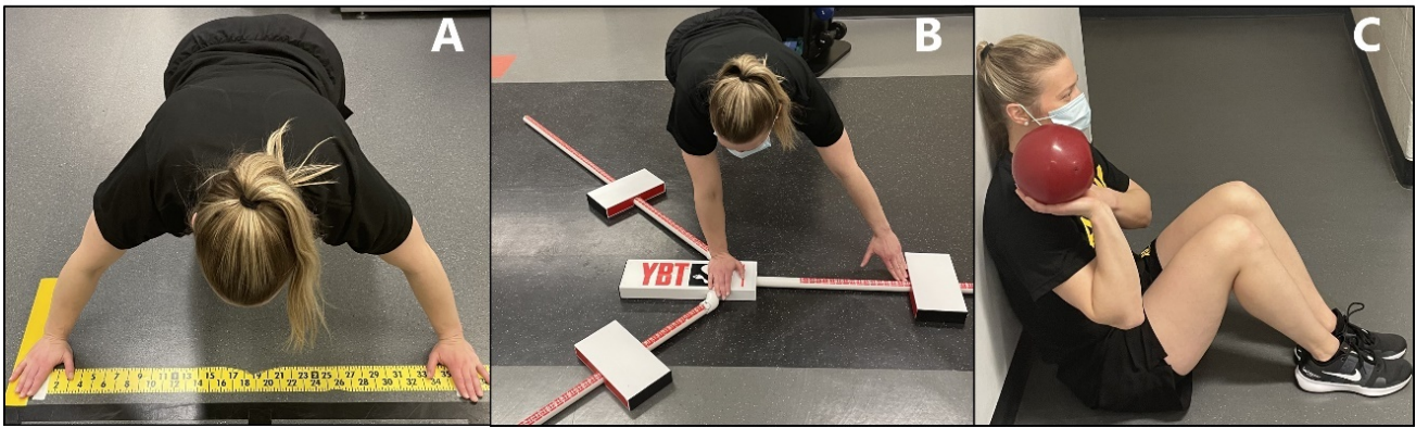
Figure 4. (A) Closed Kinetic Chain Upper Extremity Stability Test (CKCUEST), (B) Upper Quarter-Y-Balance Test (UQYBT), (C) Unilateral Seated Shotput Test (USPT).

gresses in the scapular plane. 34 The hand-held dynamometer was placed proximal to the elbow.