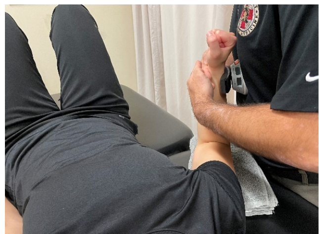
Figure 3. Handheld dynamometry testing for shoulder external rotation

Abduction strength was assessed with the participant seated on the plinth with their shoulder abducted 45 de-