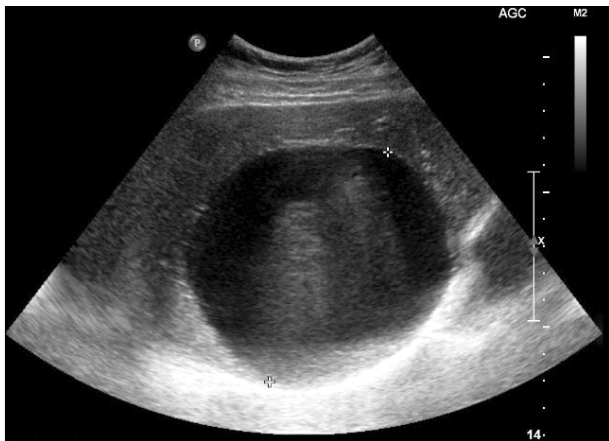
Fig. 3. Abdominal ultrasound shows a well-defined hypoechoic lesion.

with hematoma; one developing acute renal failure; and one death due to acetic acid intoxication. There was no postoperative complication in the unroofing group. However, there was a bleeding developed in one patient during the operation, and converted to open procedure for this patient. There was a bile leak from cyst wall in one case during the operation, and it was closed with suture ligation (Table 3).