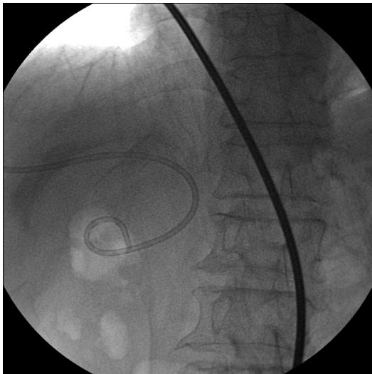
Fig. 1. A pigtail catheter was inserted into the cyst under ultrasound guidance.