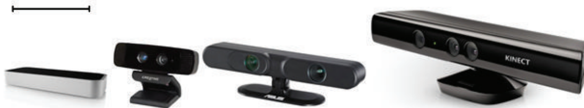
FIGURE 3: Different motion sensing devices roughly scaled to compare their sizes: from left to right Leap Motion Controller, Intel Creative Gesture Camera, Asus Xtion, and Microsoft Kinect; the scale bar is 10 cm.