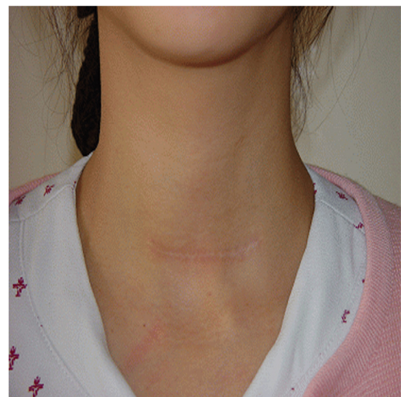
Figure 3 Incision for conventional open thyroidectomy. The length of the incision is 6.0 cm.