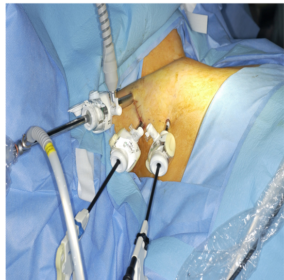
Figure 1 Operative view of ipsilateral axillary approach endoscopic thyroidectomy. Two trocars (5mm and 10mm) are inserted through axillary incisions. CO 2 gas is insufflated via one 10-mm trocar, and the 10-mm rigid endoscope is inserted via this trocar.

After the sternocleidomastoid muscle and the strap muscle had been identified, the medial border of the sternocleidomastoid muscle was dissected from the strap