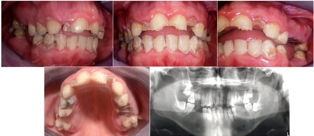
Fig. 1: Initial oral state. (1) Right lateral intraoral photography, (2) Frontal intraoral photography, (3) Left lateral intraoral photography, (4) Upper occlusal intraoral photography and (5) Orthopantomography.