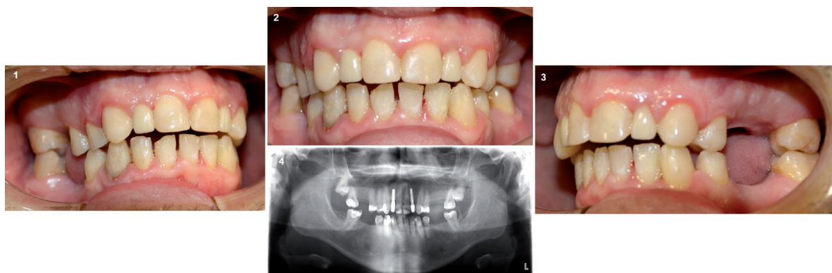
Fig. 3: Follow up after 1 year. (1) Right lateral intraoral photography, (2) Frontal intraoral photography, (3) Left lateral intraoral photography and (4) Orthopantomography.