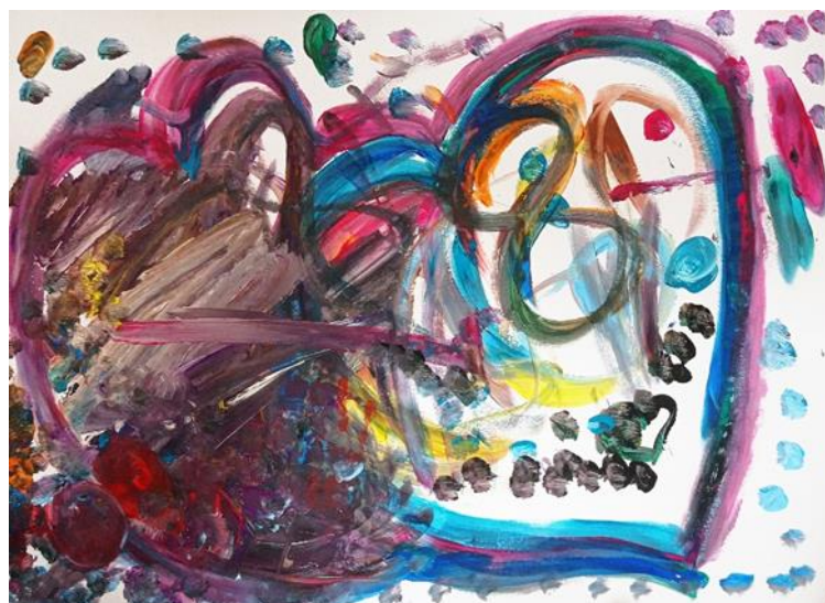
Figure 1. Rona and her mother.

When they were asked to draw in their individual spaces, Rona’s mother placed a paintbrush in Rona’s hand and said: “A paintbrush for you and one for me”. Rona was curious about the paintbrush and painted a blue line without any help. Her mother encouraged her, and Rona tapped on the page with the paintbrush. Her mother outlined the heart she had drawn in red and connected it to Rona’s border. When her mother encouraged Rona to continue, Rona painted in black inside and outside her mother’s heart, and then added yellow inside her mother’s heart shape. Rona mixed a large quantity of different color paints until the color turned brown–purple, and then smeared thick layers on the page. Her mother painted the heart that she had drawn beforehand for Rona using the thick paint that Rona had left on the page, and Rona painted over it in various colors (see Figure 1).