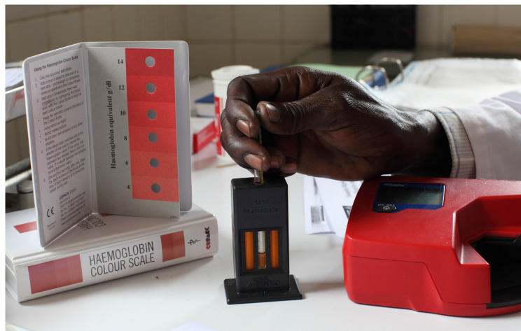
Figure 1. The Haemoglobin Colour Scale, Sahli's meter and HemoCue® analyser for rapid assessment of haemoglobin status.

All children aged over 2 months to 12 years were assessed at triage for pallor. Children were included, following parental consent, if assessed to have a pallor. Children whose guardian or parent declined consent were excluded from the study. We recruited a total 322 participants: 200 (62.3%) from Mbale and 122