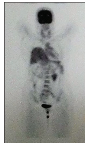
Figure 2: Positron emission tomography–computed tomography image showing pulling up of the right hemidiaphragm

Chest radiography is the most common imaging modality used to diagnose eventration. If chest radiograph is indeterminate, then the use of spiral CT with thin sections is preferred for confirming the diagnosis. MRI is used as an additional modality to evaluate the diaphragm in patients with clinical signs but questionable findings on chest X-ray and CT scan. [8] Additional investigations such as ultrasonography chest, fluoroscopy, and contrast GI screening can also be done to rule out complications. Asymptomatic patients should be managed conservatively, but symptomatic patients, those with both progressive and acute respiratory failure are surgically managed. Plication of the diaphragm is the procedure of choice, [9] with minimally invasive techniques