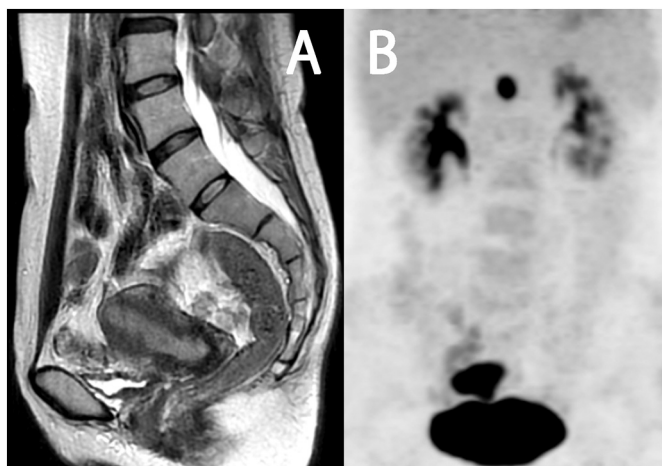
Fig. 1. (A) T2-weighted pelvic magnetic resonance imaging (MRI) in the sagittal plane. The tumor invaded into the more than half of the myometrium and developed in polyps, although cervical stromal invasion was not observed. (B) Positron emission tomography-computed tomography (PET-CT) image, confirming fluoro-deoxyglucose (FDG) accumulation in the paraaortic region, in the upper level of left kidney.