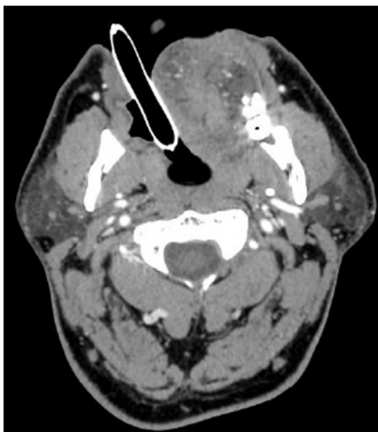
Figure 2. CT scan performed with patient intubated and assisted ventilation.

through its binding to the \beta subunit of the GABA receptor. The sites of the \beta_1 , \beta_2 and \beta_3 subunits of the transmembrane domains play a key role in the hypnotic action of propofol 8,9 . The onset of hypnosis after administration of a dose of 2.5mg/kg is rapid (arm-brain circulation) and reaches a maximum effect after 90 to 100 s. The median effective dose (ED 50 ) of propofol for unconsciousness is between 1 and 1.5mg/kg for bolus administration. The duration of hypnosis depends on the dose and is between 5 and 10 min of a dose of 2 to 2.5mg/kg 10 . Although, the effect of propofol on epileptogenic EEG activity has raised some controversy. It could suppress seizure activity through GABA agonism, inhibition of NMDA receptors (RNMDA), and modulation of slow calcium ion channels. However, this agonism with GABA and antagonism with glycine could induce clinical seizures and epileptiform alterations in the EEG 11 , especially during the induction of anesthesia and awakening.