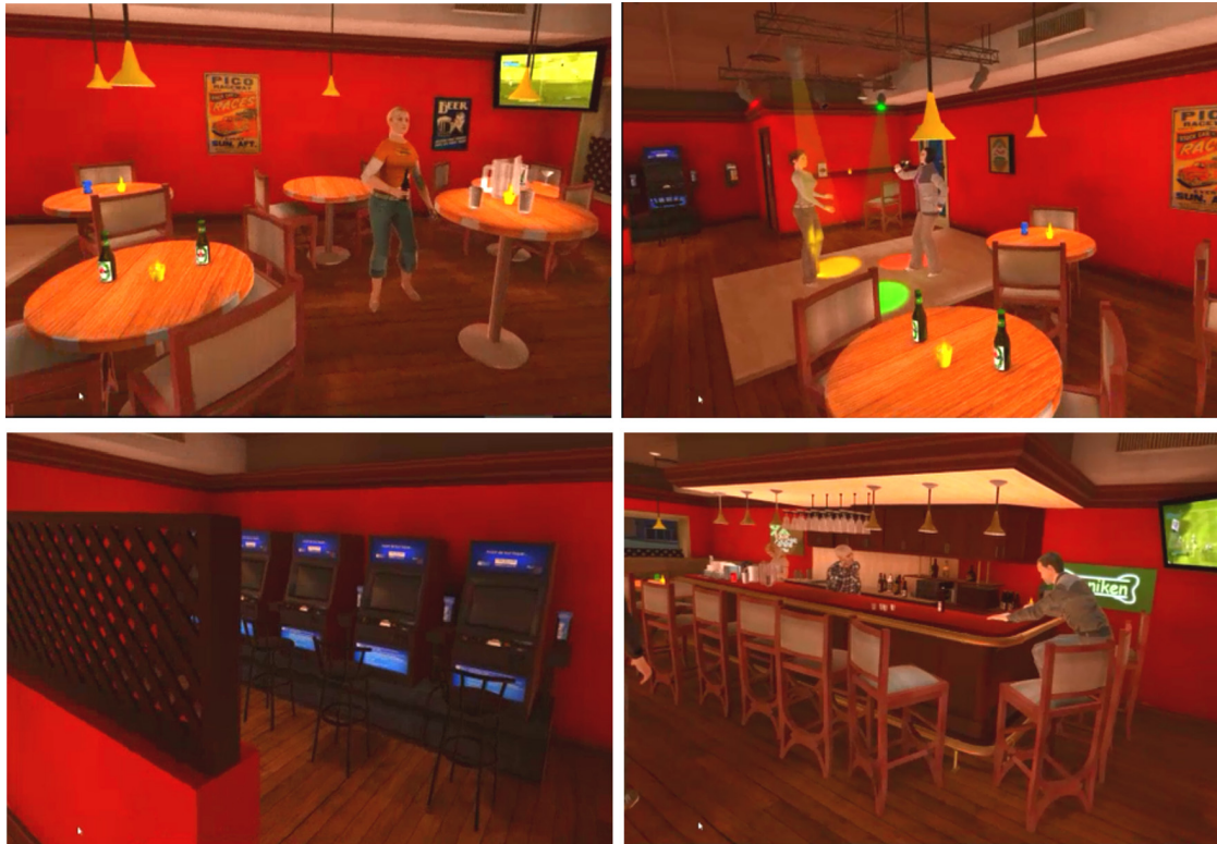
FIGURE 1 | Screenshot of the virtual environment.

this stage was not recorded. Once the time was up, participants removed the helmet and were invited to complete four scales evaluating craving and the ITC-SOPI questionnaire. Finally, the experimenter explained to the participants the real purpose of the study (i.e., debriefing) before asking them to sign a second informed consent.