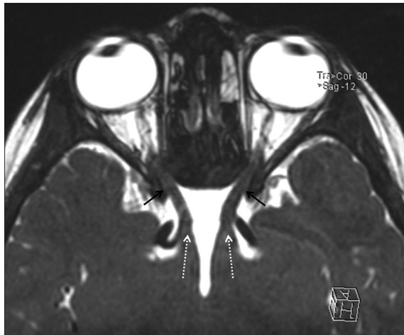
Figure 3: Curved planar reformatted axial section of heavily T2-weighted image of magnetic resonance imaging brain showing isolated absence of optic chiasm with unremarkable optic nerves (black arrows) and optic tracts (dashed white arrows)

septo-optic dysplasia and in patients with albinism. However, isolated absence of optic chiasm is rare, with only a few cases reported previously. [7]