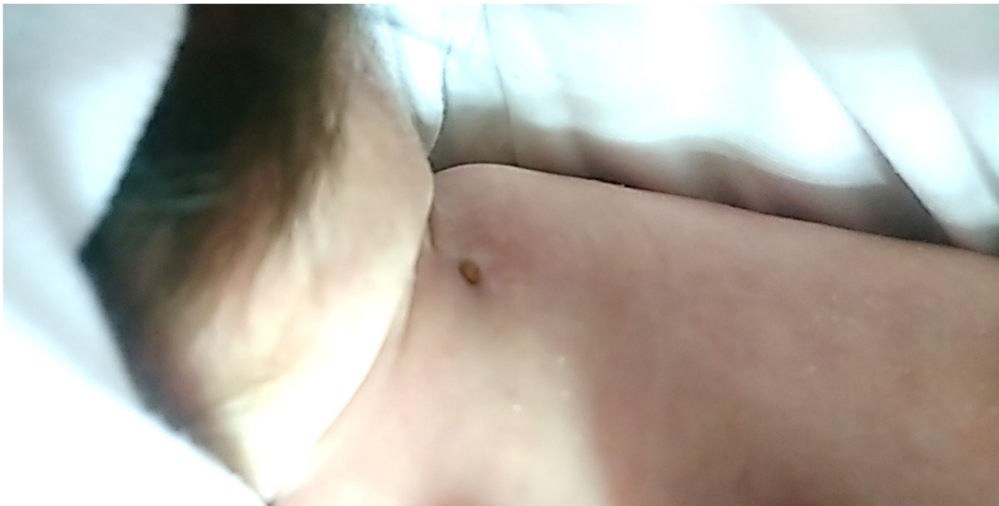
Figure 1. Neck abscess during healing.

a 41-year-old primigravida. During pregnancy, the mother presented hypothyroidism treated with levothyroxine and gestational diabetes managed with diet. The neonate received mechanical ventilation and therapeutic hypothermia due to moderate hypoxic-ischemic encephalopathy and episodes of tonic-clonic seizures. During the last days of her hospitalization, she developed a neck abscess without any underlying palpable swelling, which was ruptured, drained and treated with antibiotic therapy. She was discharged at the age of 4 weeks without any other skin lesion and receiving no further treatment (Figure 1).