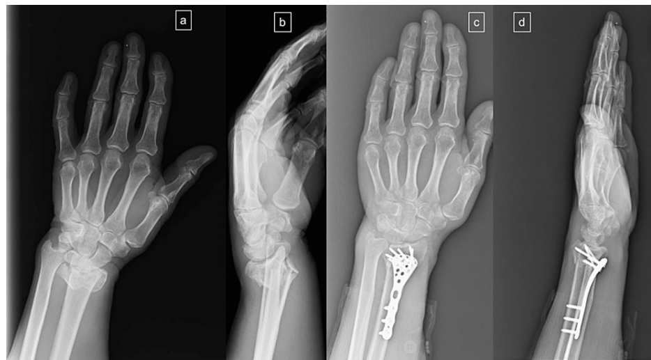
FIGURE 1: A 68-year-old male with an intraarticular comminuted distal radial fracture treated with a volar locking plate

Surgical procedures for group 1 were performed via a volar modified Henry approach between the radial artery and the flexor carpi radialis tendon. The approach is deepened between the flexor pollicis longus and the radial artery. The pronator quadratus muscle was incised in an L shape, reduction was performed under fluoroscopy, and fixation was performed with a locking anatomical distal radius plate (Figure 1).