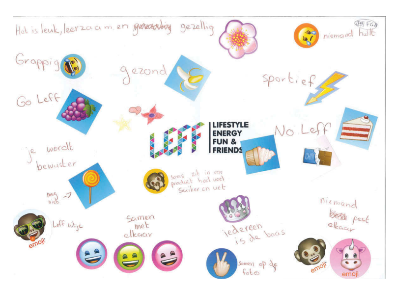
Figure 2. Example of used methods:Poster.

All of the interviews were audio-recorded and transcribed with the exception of the focus groups, since it was impractical to use a recording device in the midst of the poster work. Focus group data was recorded by hand during the discussion and processed in detail immediately afterwards. An ethnographic content analysis was performed by PGW using QDA Miner Lite 2.0, and the coding was