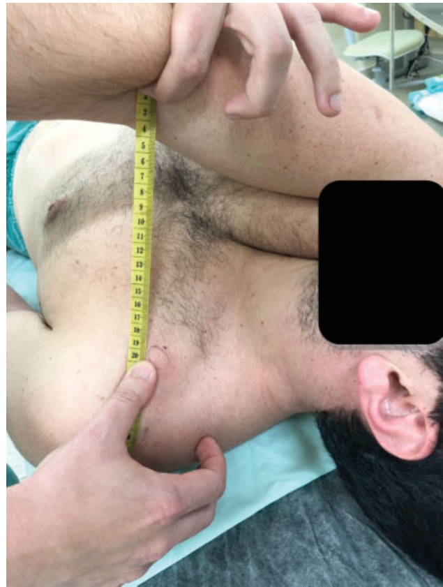
Fig. 2 Supine position adopted during physical examination showing the distance between the coracoid process and the cubital fossa.