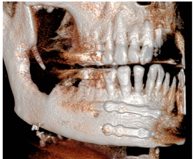
Fig. 3. 3D reconstruction, stage III ORN, lingual plate bone loss. Rim mandibulectomy is apparent.