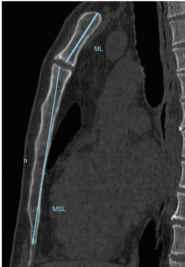
FIGURE 2. Sagittal reformatted MDCT image shows the sagittal dimension of the manubrium. (ML) and the sagittal dimension of the mesosternum (MSL).