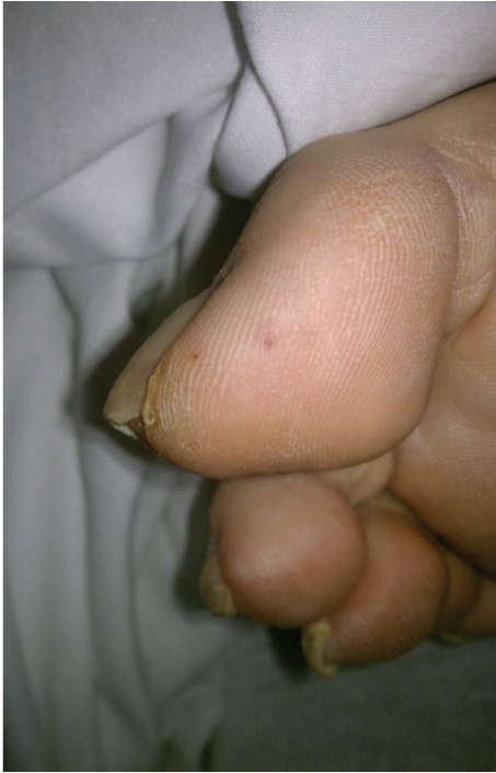
FIGURE 1: Right first toe with Janeway lesion (vascular emboli phenomena).