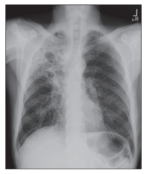
FIGURE 1: Chest X-ray showing cavitary opacity in the right upper lung field.