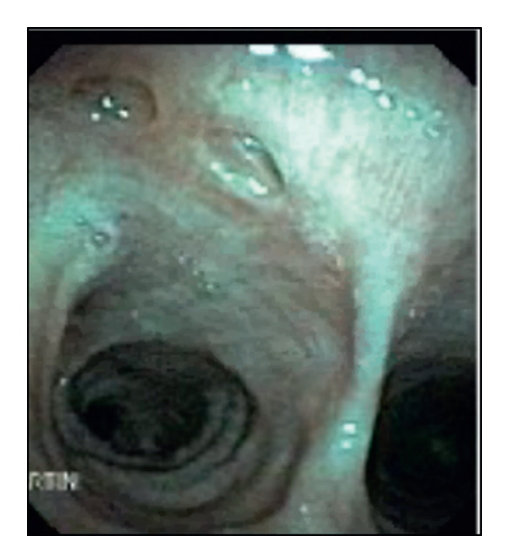
FIGURE 5: Bronchoscopy (posttreatment). There are two healed fistulas in the right posterior mainstem (posterior to carina), measuring approximately 0.5 cm each.