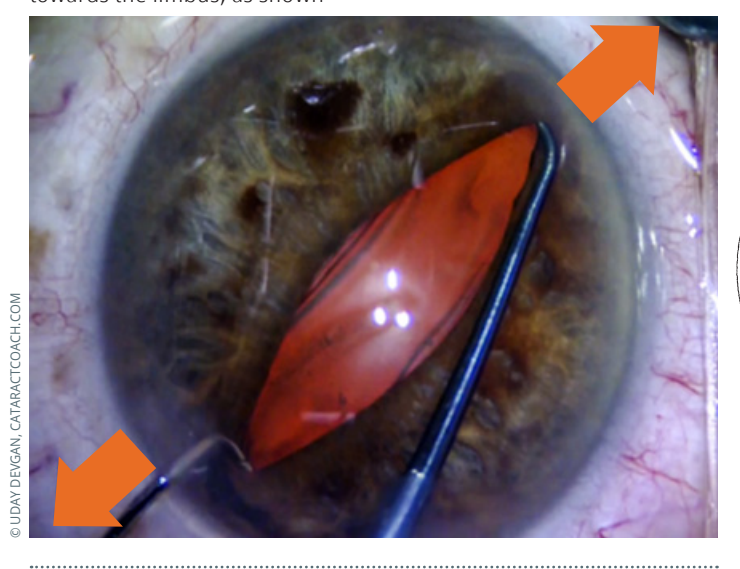
Figure 1 Place the instruments 180° apart and stretch the pupil towards the limbus, as shown<sup>4</sup>