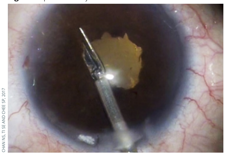
Figure 3 Sphincterotomy