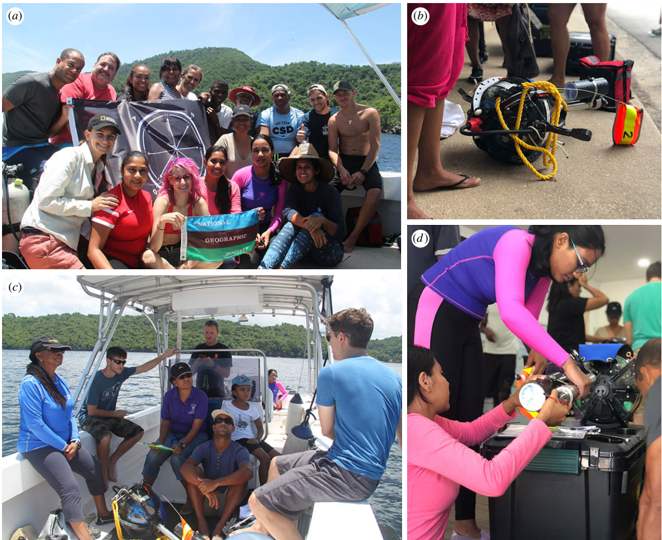
Figure 4. ‘My Deep Sea, My Backyard’ in Trinidad and Tobago. (a) The project team. (b) The National Geographic Deep-Sea Drop Camera. (c) Participants learning to deploy the National Geographic Deep-Sea Drop Camera at sea. (d) Participants learning to prepare the National Geographic Deep-Sea Drop Camera for deployment.