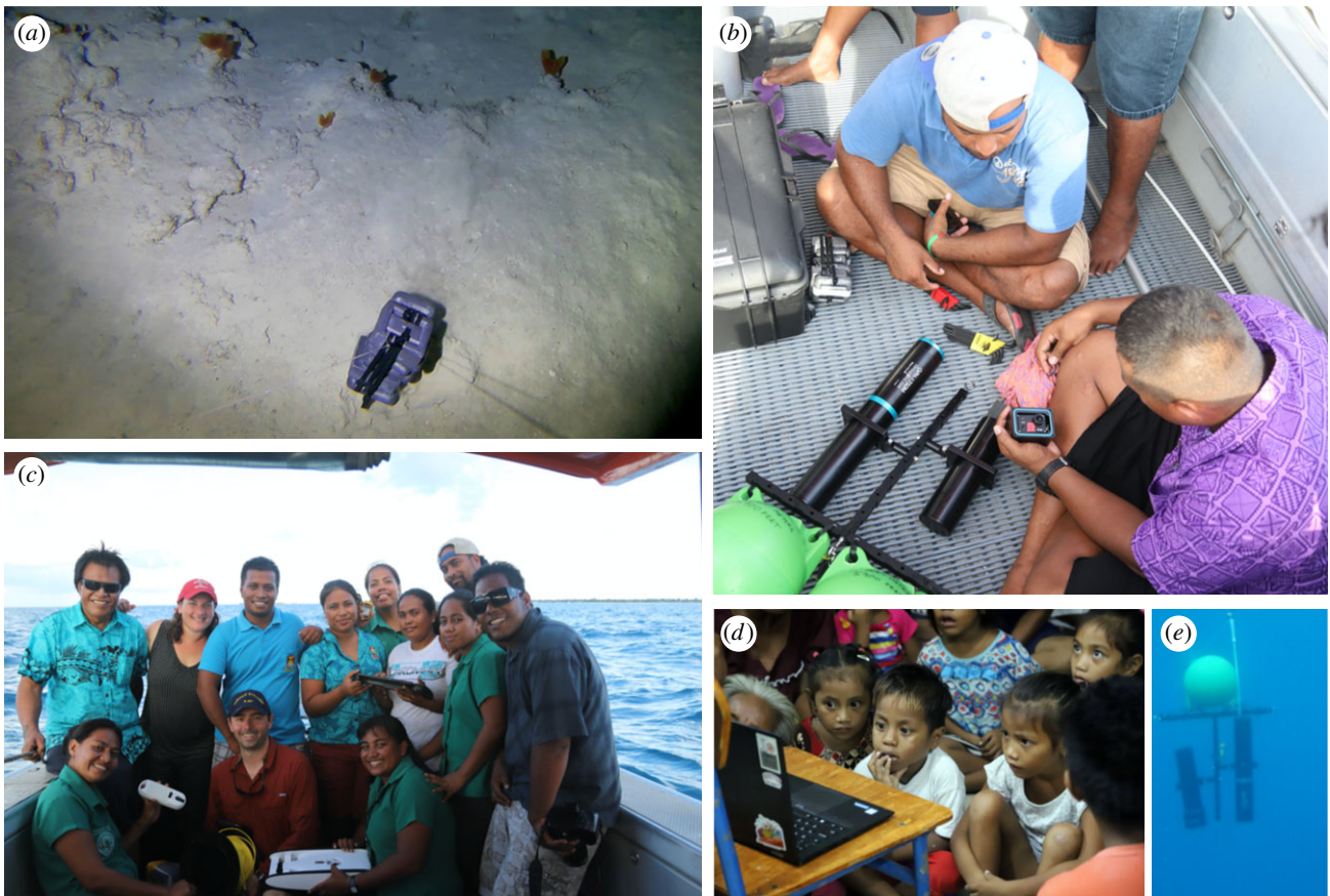
Figure 3. 'My Deep Sea, My Backyard' in Kiribati. (a) Tarawa seafloor image captured by the ReelCam from approximately 800 m, with benthic ctenophores and soft sediment. (b) Government of Kiribati fisheries staff prepared the ReelCam for deployment. (c) The 2018 project team. (d) Kiribati school children see the deep ocean for the first time. (e) Deep-ocean ReelCam descending from the surface.

than 200 m) can be found less than 4–5 km from any point on the land and occupies 99.6% of the EEZ.