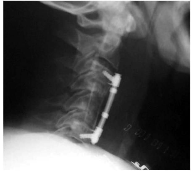
Figure 1. Post-Operative Lateral X-Ray Showing C3-5 Fixation With Pre-Tracheal Edema

swelling (Figure 1, 2). Supportive management continued and tracheal tube was removed successfully on post-op day nine.