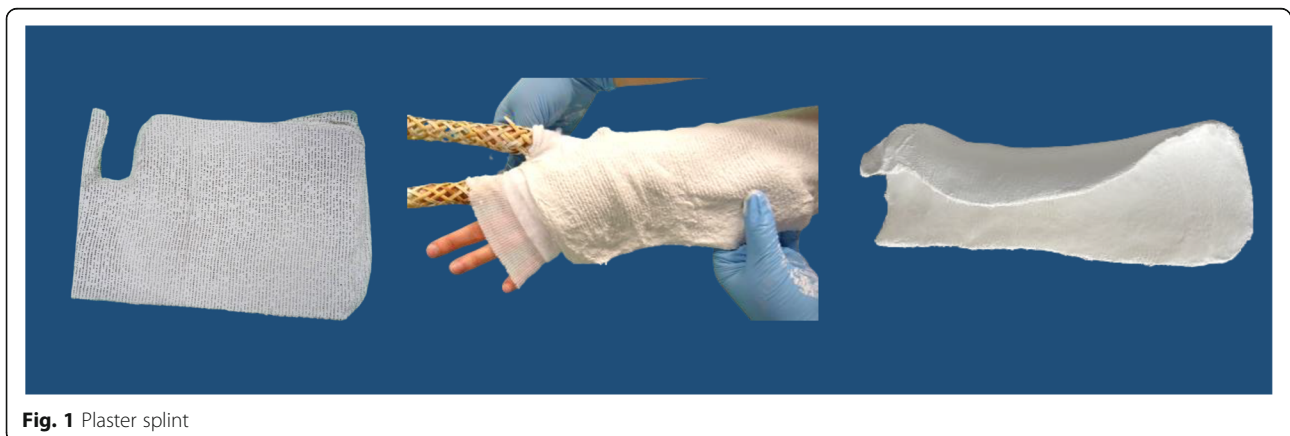
Fig. 1 Plaster splint