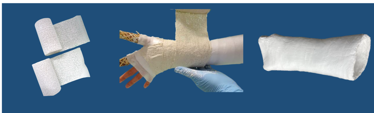
Fig. 2 Circumferential cast