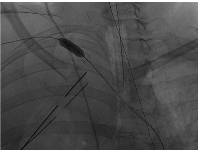
Fig. 6. Second balloon dilatation to control retrograde bleeding from the vertebral artery.

cular procedure, with more pronounced balloon dilatation of the stent, definitely controlled the bleeding. Fig.6) The patient slightly improved after an open surgical debridement of the pleural space from clots and blood, given the absence of an output from the two large drains that were in place. In the next few days, the patient went back to the ward and made a gradual full recovery with no neurological or vascular defects (Table 1).