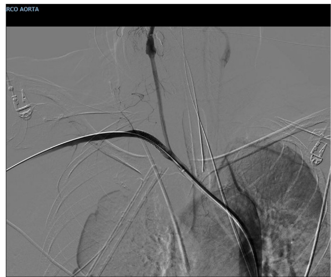
Fig. 4. Balloon dilatation to deploy the stent.

with a systolic blood pressure of 30 mmHg. An emergency thoracotomy to decompress the right chest was then performed via a V space incision, and five litres of blood under pressure were drained from the right pleural space, with a rapid improvement in the vital signs. During the endovascular procedure, the general surgeon left the thoracotomy open to allow a continuing suction in the pleural space to prevent the accumulation of clots. The endovascular procedure was conducted by the vascular surgeons and lasted 40 min, confirming the massive leak from a significant defect in the subclavian artery (Fig. 3) and consisted in a 7 × 37 mm covered stent placement in the subclavian artery at the origin of the vertebral artery. The stent was expanded with a balloon taking care of not injuring the already damaged vessel (Fig.4). The patient had a