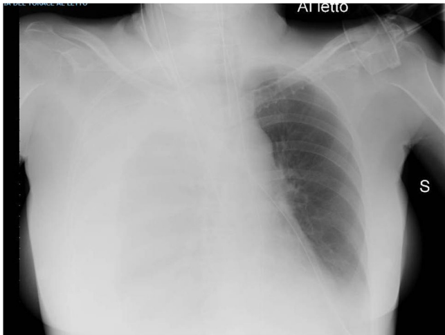
Fig. 1. Hemothorax on chest X-ray.