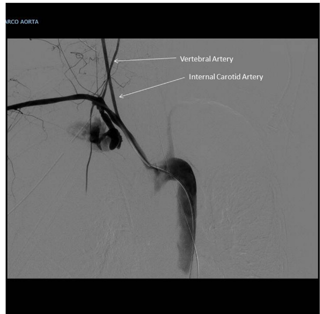
Fig. 3. Massive bleeding from the right subclavian artery on angiography.