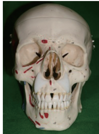
Fig. 1. The silicone implants are designed to augment both paranasal areas.

The sulcus incision was closed with 4-0 vicryl suture. Compressive tape dressing was applied to prevent swelling and hematoma formation. Postoperative regimen included prophylactic antibiotics and gargling. Compressive dressing was maintained for 5 days, and stitches were removed from 8 to 10 days after operation.