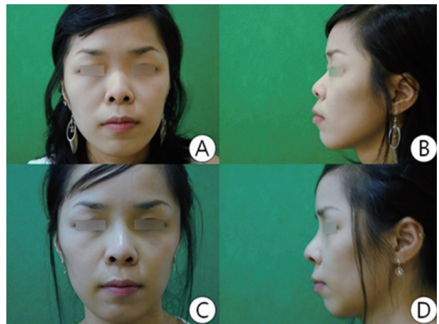
Fig. 3. This 24-year-old woman underwent a combination of open rhinoplasty with tip graft and paranasal augmentation. The augmentation led to an increase in the lower midface projection, and the effect of rhinoplasty is more pronounced. Preoperative (A, B) and postoperative (C, D) photographs.

This 25-year-old woman wished for a significant improvements in the lateral facial contour. She underwent multiple procedures, including forehead augmentation, genioplasty, rhinoplasty, and paranasal augmentation with a 5-mm implant (Fig. 4).