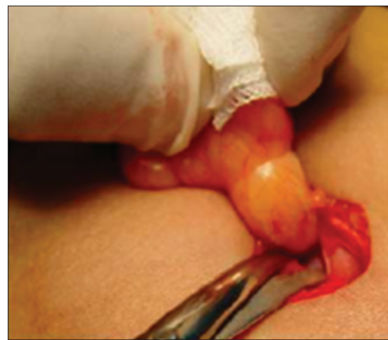
Figure 2: Hernial sac removal