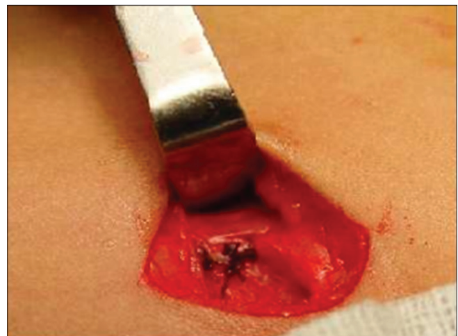
Figure 3: Femoral ring closure using Lytle procedure

symptoms in the neonatal period that led to the thought that there must be some congenital anatomic causal factors. [13]