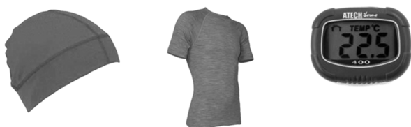
Figure 1 The thermals and thermometer supplied to the intervention group.